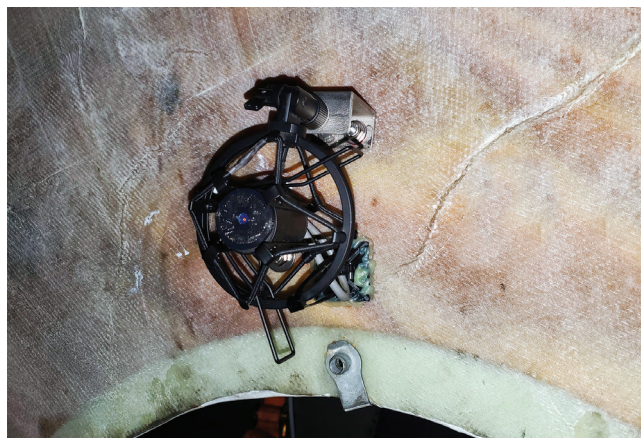
Figure 3. Unattended sensors, mounted within each blade, detect and locate damage down to a single blade, enabling operators to identify and mitigate damages quicker than with traditional inspection methods.

An integrated approach to blade management reduces downtime, increases efficiency, saves money, and creates a more organic working relationship for sustained wind operations.