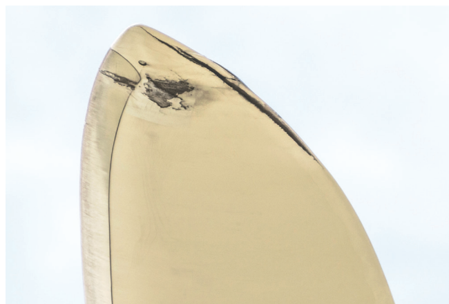
Figure 1. Defects on blades are sometimes visible but often hidden. MISTRAS uses advanced acoustic emission (AE) technology to proactively detect damages including lightning strikes, skin perforations and ruptures, cracking, and more.

AE sensors are installed on wind turbines – with one sensor installed within each of the three blade bulkheads, and a data acquisition system installed in the turbine hub. The sensors and data acquisition system continuously feed